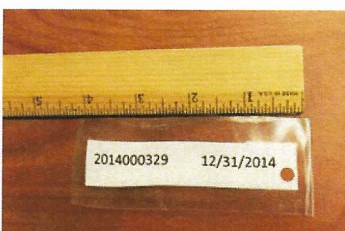
Waterproof Gorilla Tape (folded with solid color insert)