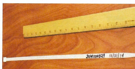
1/4" x 24" Cable Ties

WARNING: Untagged cannabis plants or improperly tagged cannabis plants (not meeting the above requirements) are subject to confiscation and removal by law enforcement, and the grower or property owner is not guaranteed the protections available in chapter 329, Hawaii Revised Statutes.